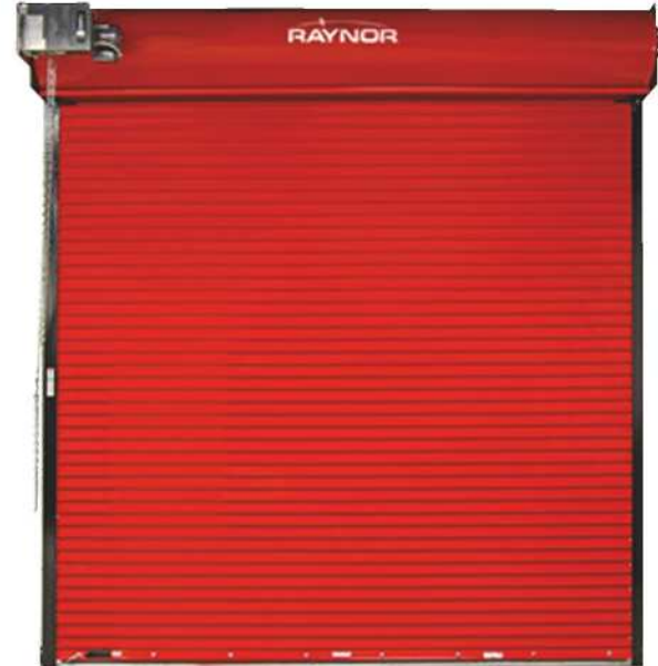
FireCoil, Red Powder Coated